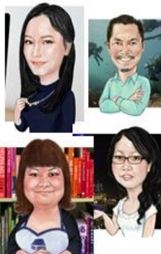
Get to Know Your 2019-2021 Council Members