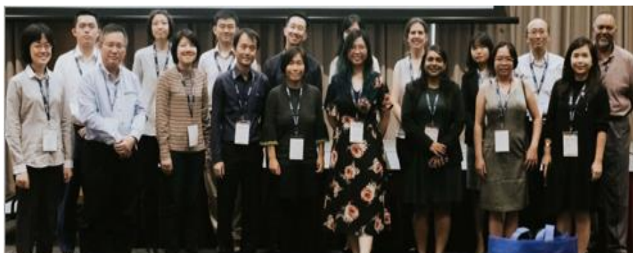
LAS 2019 Conference Speakers

We appreciate our conference sponsors for their generous support and would like to take this opportunity to express our appreciation to the conference organising committee, as well as extended members and volunteers who came forward to support the event.