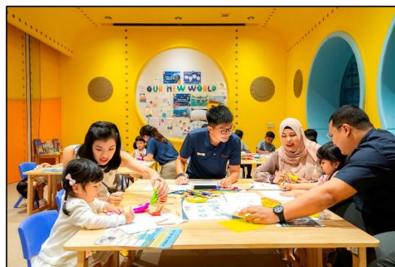
Figure 5: Children and parents participating in a workshop in The Submarine

There is also a programme room called The Submarine due to its resemblance to a submarine and it is equipped with a whiteboard and a projector for different types of programmes. The bright and cheerful space hosts storytelling sessions, craft workshops, and biodiversity-related programmes curated by the S.E.A. Aquarium and regular children library programmes. The Submarine, strategically located in the furthest corner of CBLSEAA, encourages programme participants to explore the library before and after each session. Participants who sign up online and attend the in-person programmes get to discover the library which ultimately leads to them being converted to active users of the library.