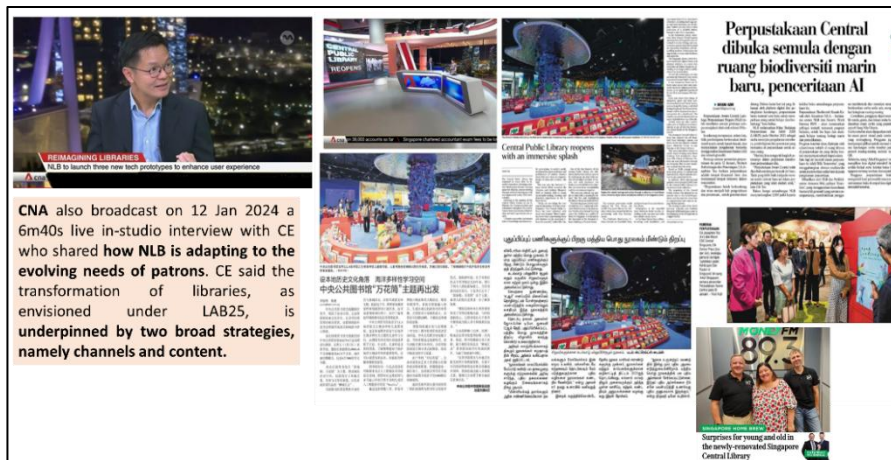
Figure 16: Snapshots of mainstream media coverage