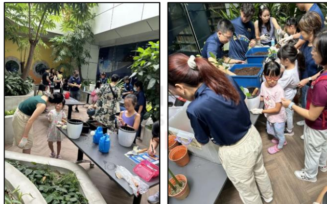
Figures 8 and 9: Magnificent Mangroves