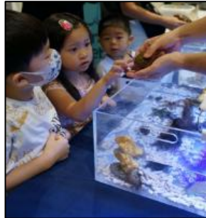
Figure 12: Children participating in the Green Market