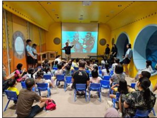
Figure 7: A Day in the Life: Aquarium Edition