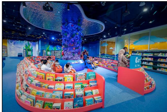
Figure 2: Books for babies and young children surrounding the coral column in the Coral Zone

books together from the low, front-facing shelves.