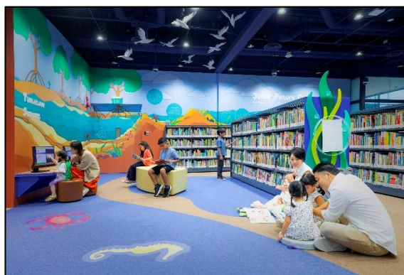
Figure 1: Children reading with their parents in the Intertidal Zone

Children visiting CBLSEAA would be able to move across the three main immersive zones of the library on a journey from seashore to deep sea. The Intertidal Zone, nearest to the entrance, is targeted at children aged 4 – 6 years, with seagull mobiles suspended overhead, infographics on intertidal creatures, and multimedia stations where children can watch animated stories.