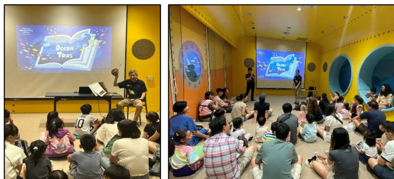
Figures 10 and 11: Ocean Tales by RWS Senior Management