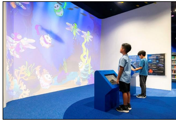
Figure 4: Children customising their avatars at KidSpot gamification kiosks

There is also a programme room called The Submarine due to its resemblance to a submarine and it is equipped with a whiteboard and a projector for different types of programmes. The bright and cheerful space hosts storytelling sessions, craft workshops, and biodiversity-related programmes curated by the S.E.A. Aquarium and regular children library programmes. The Submarine, strategically located in the furthest corner of CBLSEAA, encourages programme participants to explore the library before and after each session. Participants who sign up online and attend the in-person programmes get to discover the library which ultimately leads to them being converted to active users of the library.