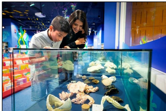
Figure 3: A boy and his mother viewing the items on display at the marine specimen showcase

The third and deepest zone is the Sea Jellies Zone, which holds the collection for children aged 7 – 12 years. There, they can enjoy a calming video projection of sea jellies and other ocean creatures, explore a marine specimen showcase of shells, coral skeletons, and shark jaws, as well as learn about the dangers of pollution from a model of an albatross with plastic waste in its abdomen.