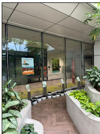
Figure 6: Mangrove saplings in the Courtyard

With its intricately designed and carefully planned zones, CBLSEAA was envisioned to be an educational and immersive platform for children aged 12 years and below to learn about marine biodiversity and sustainability with the aim to inspire action.