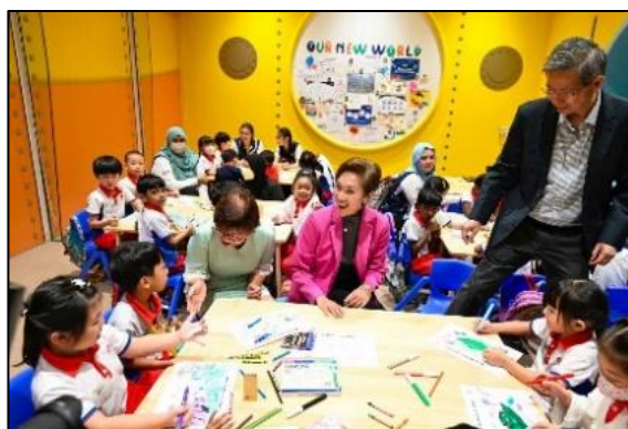
Figure 14: Preschoolers participating in a colouring session in The Submarine on Launch Day