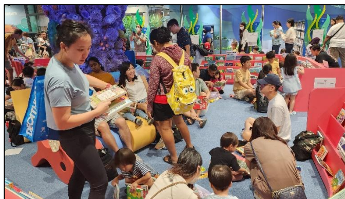
Figure 15: A crowded CBLSEAA full of happy families reading together

Since then, CBLSEAA has seen a steady increase in visits, welcoming nearly 488,876 visitors in its inaugural year from January to December 2024. This contributed to 58% of overall visitors to the Central Library.